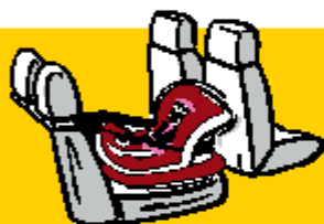
0 – 6 months: Rearward-facing restraint