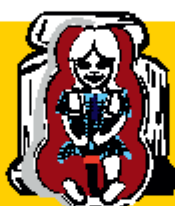
6 months – 4 years: Child restraint