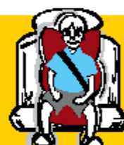
4 – 7 years: Child restraint/booster seat