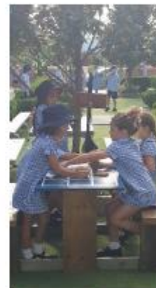
Noughts and Crosses