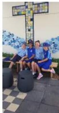
A quiet place to play Chess