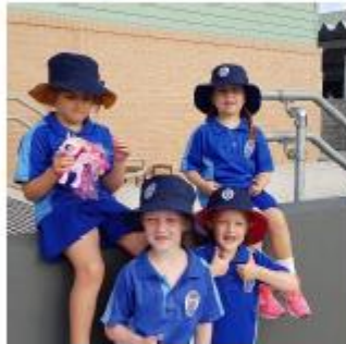
Kindergarten having fun