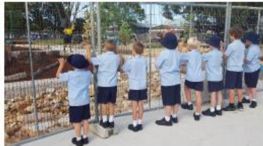
Eagerly awaiting the re-opening of the sandpit, rock garden and new play spaces