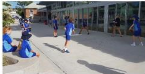
Handball is a favourite past time