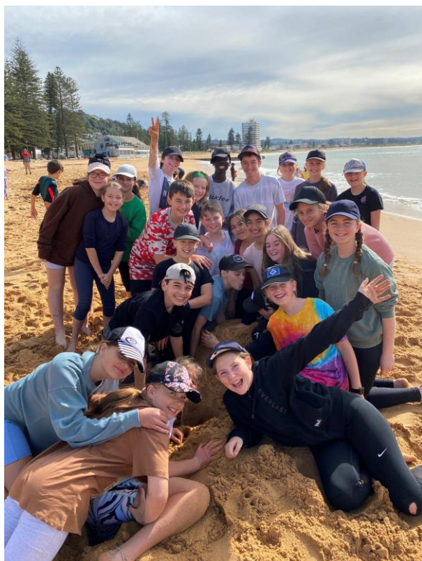
Year 6 Teachers

Last week our Year 6 students went on a 3 day camp at The Collaroy Centre located at Sydney's Northern Beaches. The camp is set in bushland with stunning views. Here the children participated in a wide range of activities such as archery, rock climbing, high ropes, laser tag, orienteering, and even a visit to the beach. They were busy from breakfast until supper! The camp provided the students with an opportunity for personal growth, as they learn fundamental skills of teamwork, building resilience, encouraging others, leadership and problem solving. The children have walked away with memories they will treasure for a lifetime!