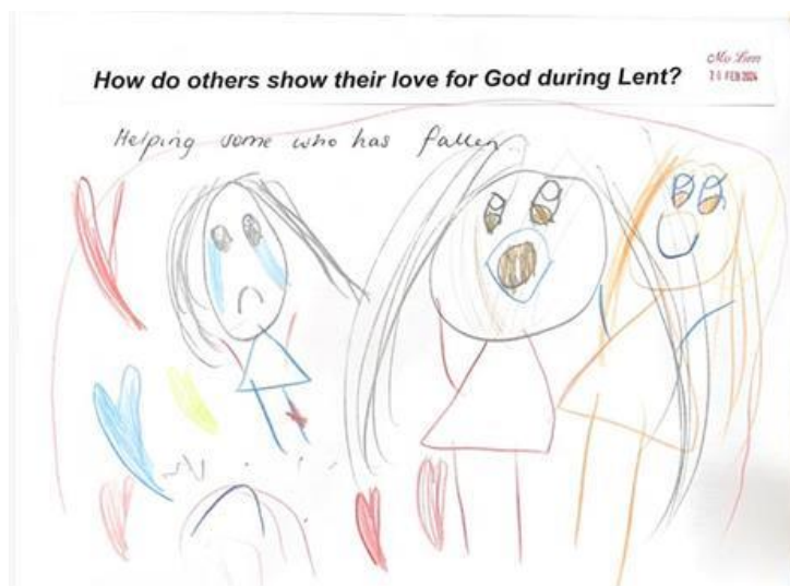
Audrey – KL